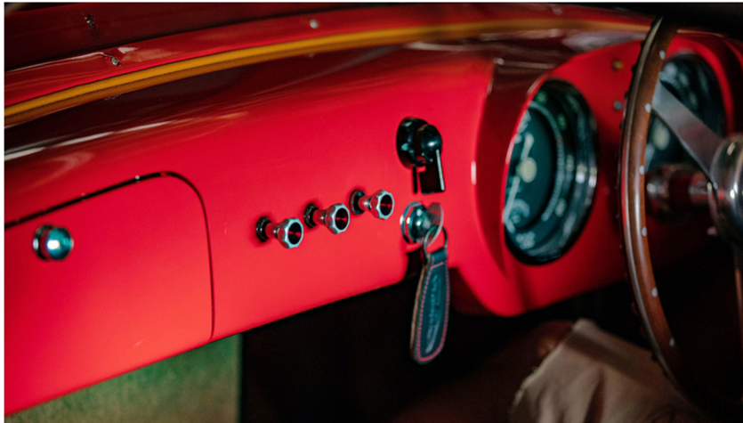
Hand crafting a proper Italian dashboard is a complex task.

The chassis, engine and drivetrain remain essentially original, other than certain modifications to fit a shortened wheel base, engine and intake/carburetion modifications and converting the car to right hand drive (all utilizing original Ferrari and/or period correct parts). In addition, the brightwork, grill, dash, seats, and fittings are all hand made by the shop, as well as every stitch of leather.