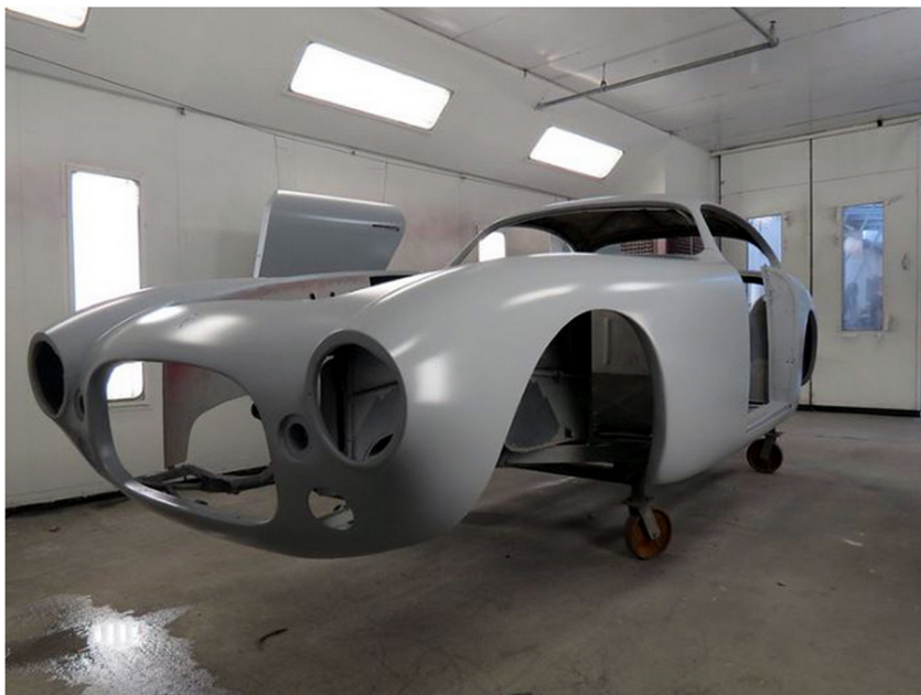
The body in the paint shop.

In 2015, Mr. Fernandez contracted with the noted restoration and coachbuilding firm, The Creative Workshop (www.TheCreativeWorkshop.com) which is a nationally recognized, full-service car restoration business dedicated to historic antique, vintage, post-war and classic, European and American cars, located in Dania Beach, Florida, just south of the Ft. Lauderdale Airport. The workshop is housed in a unique, 80+ year-old historic building that has been fully converted into a comprehensive restoration & coachbuilding facility.