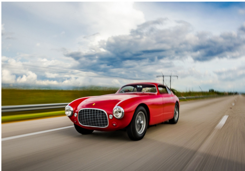
In your dreams, for real.

Since its unveiling in 2018, the car has been shown at Cavallino, the Boca Raton Concours d'Elegance and several local events in support of various charities – being presented as a “star attraction”. The car will be on display at the December 15th Orlando Festivals of Speed.