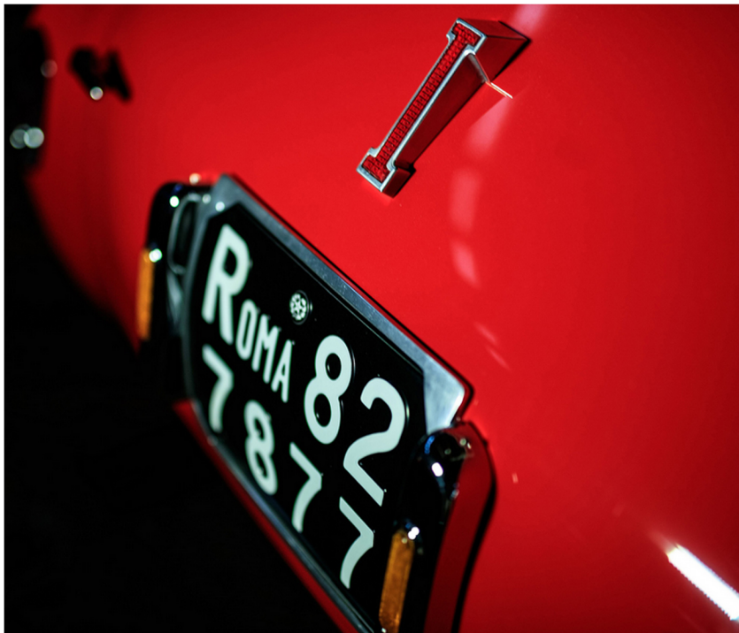
All trim items were also hand built at The Creative Workshop.

The interior is hand trimmed in authentically produced leather. Components on the car are all period correct – from original Marchal lamps to the Nardi steering wheel, Jaeger gauges and Borrani wire wheels to the Magneti Marelli switches (right down to the “nail” ignition key).