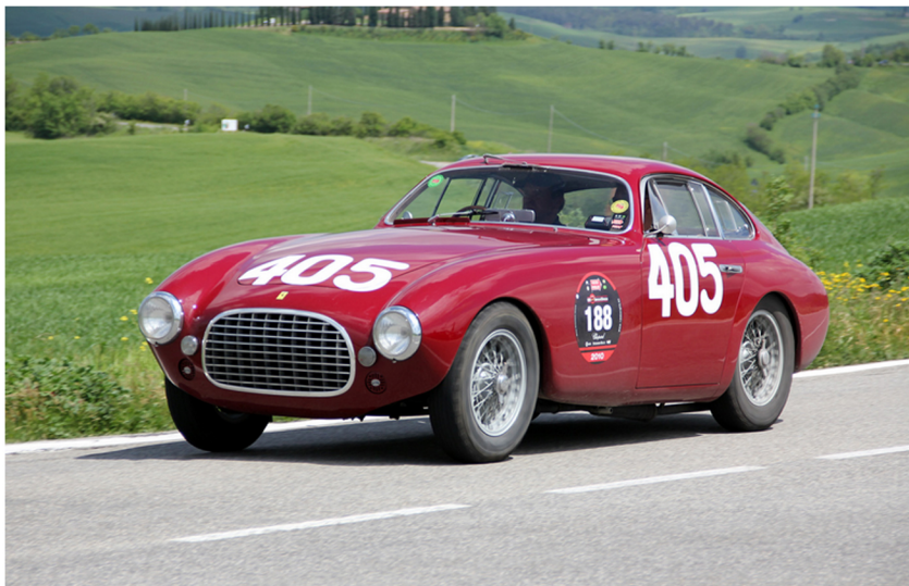
Michelotti's 340 AM, serial number 0082, on a recent Mille Miglia.