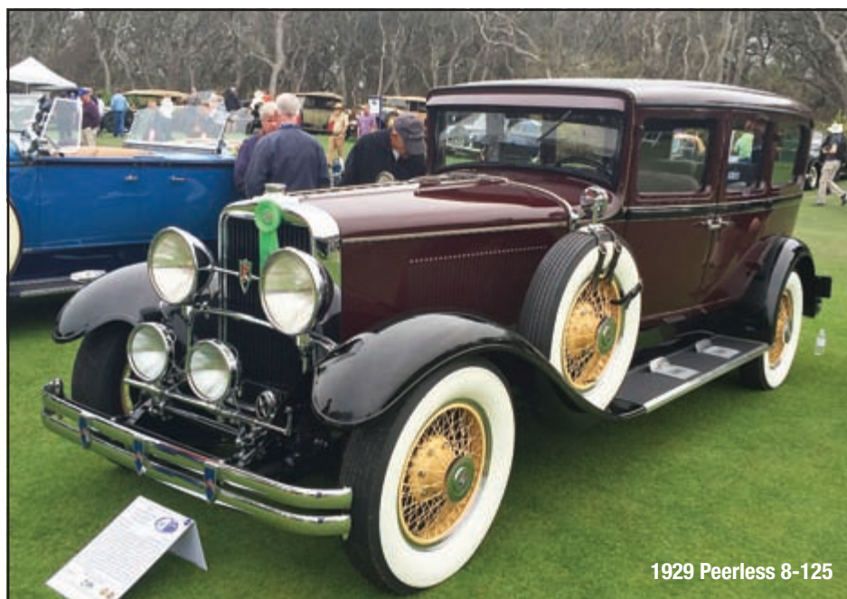
1929 Peerless 8-125