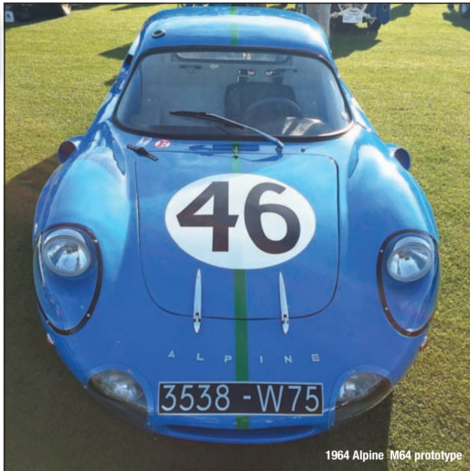
1964 Alpine M64 prototype

If only looking at the winners, it's easy to accuse Amelia Island of maintaining the status quo. But just as it's not a good idea to have a caviar buffet, they seem to understand that overindulgence in the world's highest-priced cars