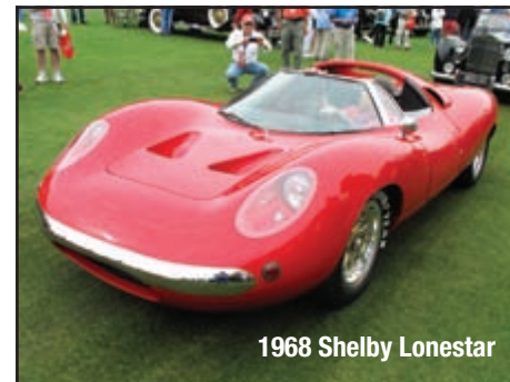
1968 Shelby Lonestar