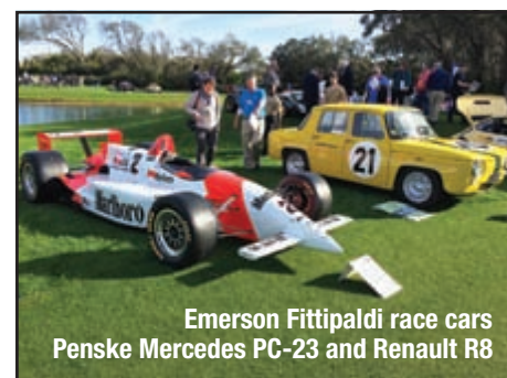
Emerson Fittipaldi race cars Penske Mercedes PC-23 and Renault R8