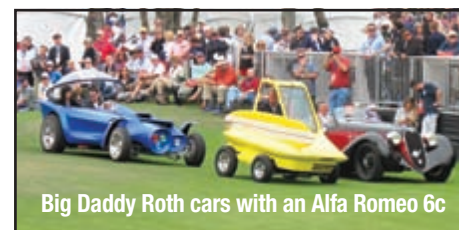
Big Daddy Roth cars with an Alfa Romeo 6c