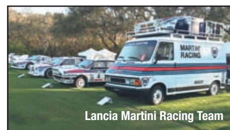
Lancia Martini Racing Team