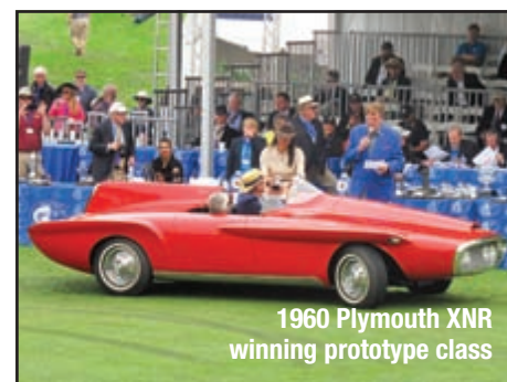
1960 Plymouth XNR winning prototype class

creates an instant desensitized feeling. That's why Amelia Island offers a much more diverse selection, even if the most intriguing vehicles don't take the top honors.