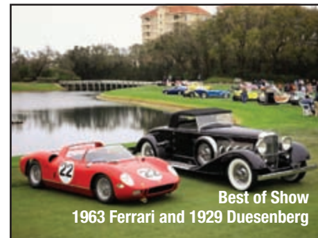
Best of Show 1963 Ferrari and 1929 Duesenberg