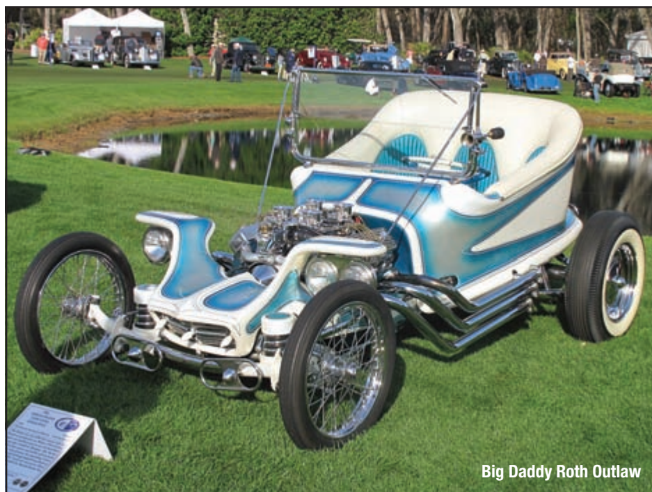
Big Daddy Roth Outlaw