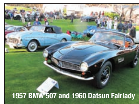
1957 BMW 507 and 1960 Datsun Fairlady