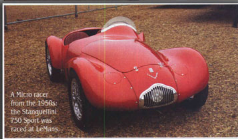
A Micro racer from the 1950s: the Stanguellini 750 Sport was raced at LeMans.