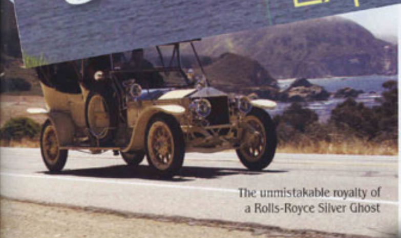
The unmistakable royalty of a Rolls-Royce Silver Ghost